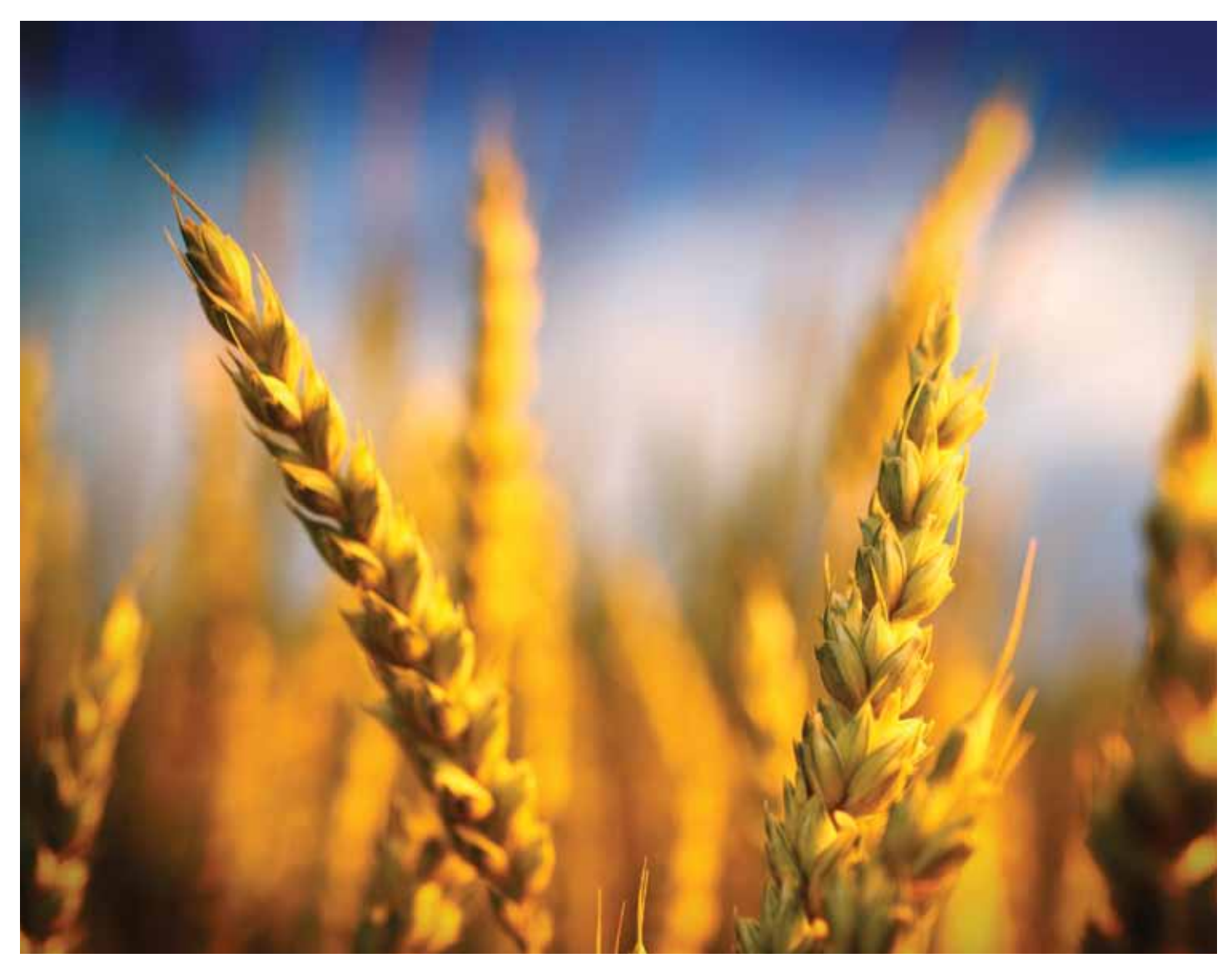
Information and Updates