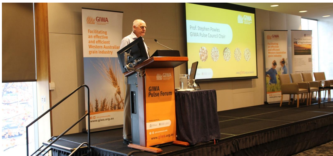
Pulse Forum, June 2022

Facilitating an effective and efficient Western Australian grain industry