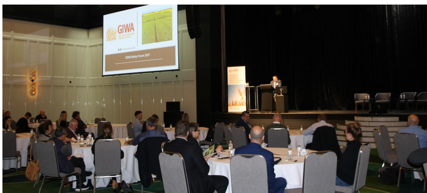
2021 Barley Forum, July 2021

Facilitating an effective and efficient Western Australian grain industry