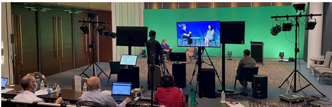
2022 GRDC Grains Research Updates, February 2022

GIWA holds the GRDC Grains Research Updates Western Region contract for a further two years (2023 and 2024).