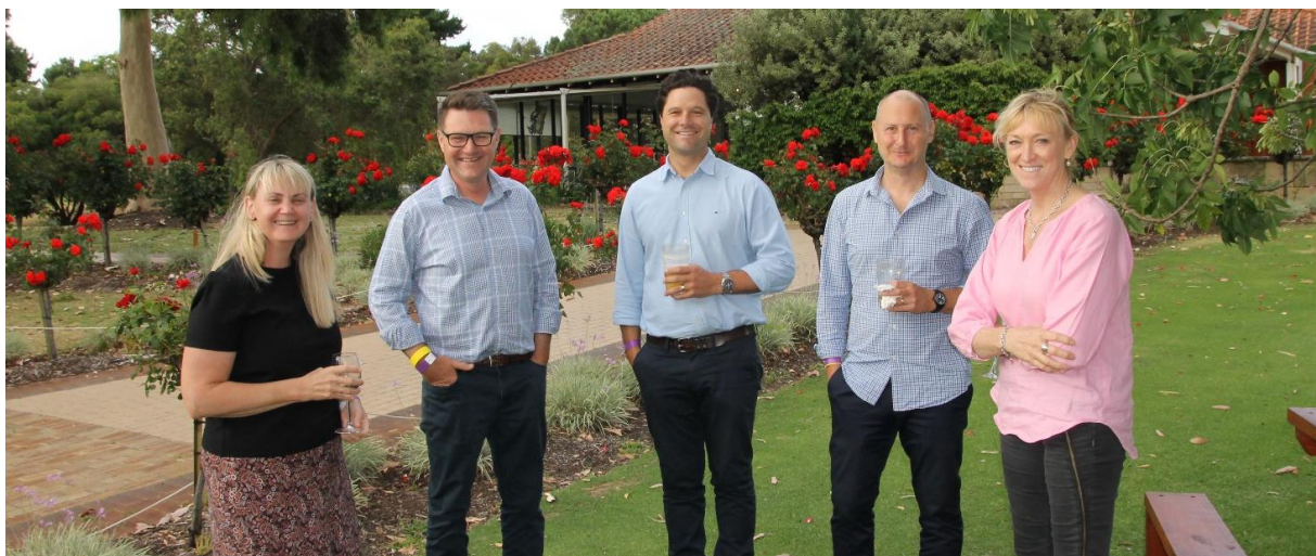
2021 End of Year Gathering