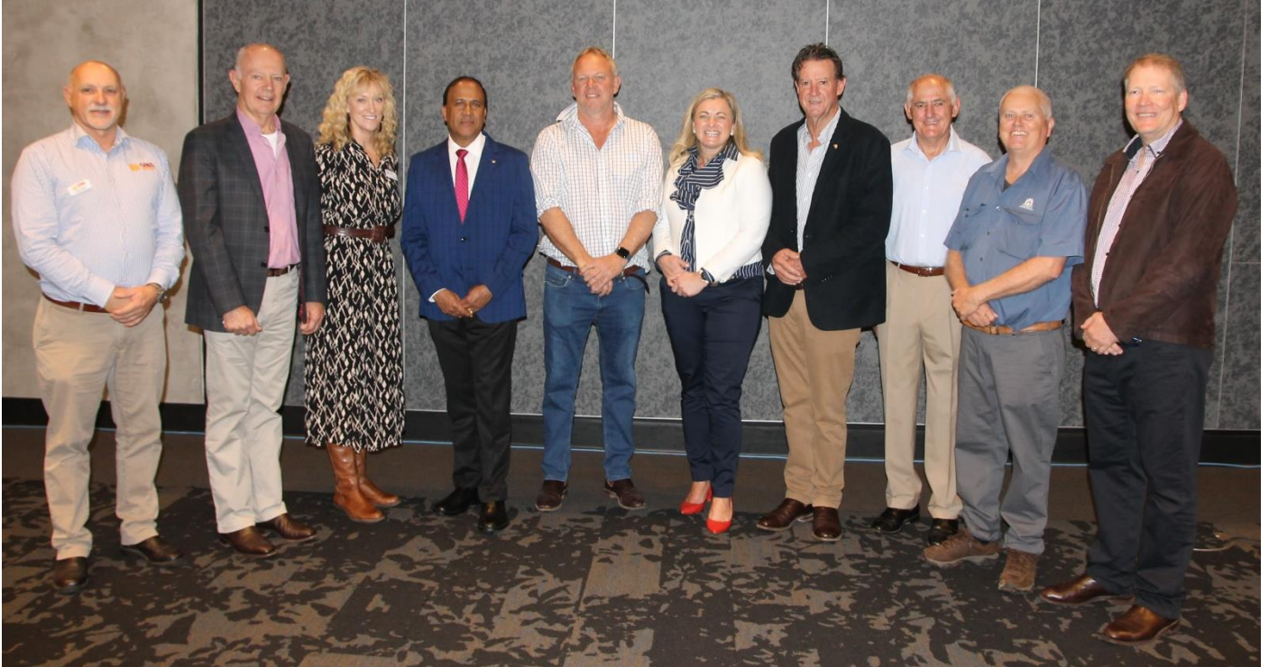
2022 GIWA Pulse Forum

In partnership with the University of WA's Institute of Agriculture (UWA IOA), the GIWA Pulse Council hosted a Pulse Forum during June 2022 . The event attracted nearly 100 in-person and virtual participants. Scientists from DPIRD, AEGIC, UWA and CSIRO; and lupin food processors, grain handlers and growers presented on the full spectrum of pulse breeding, growing, marketing, handling and processing. The need to better promote and market lupins as a human food, and gain market access into new international markets, was a strong theme throughout the day.