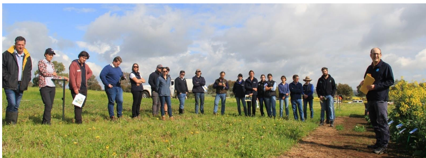
Oilseeds Field Day, August 2021